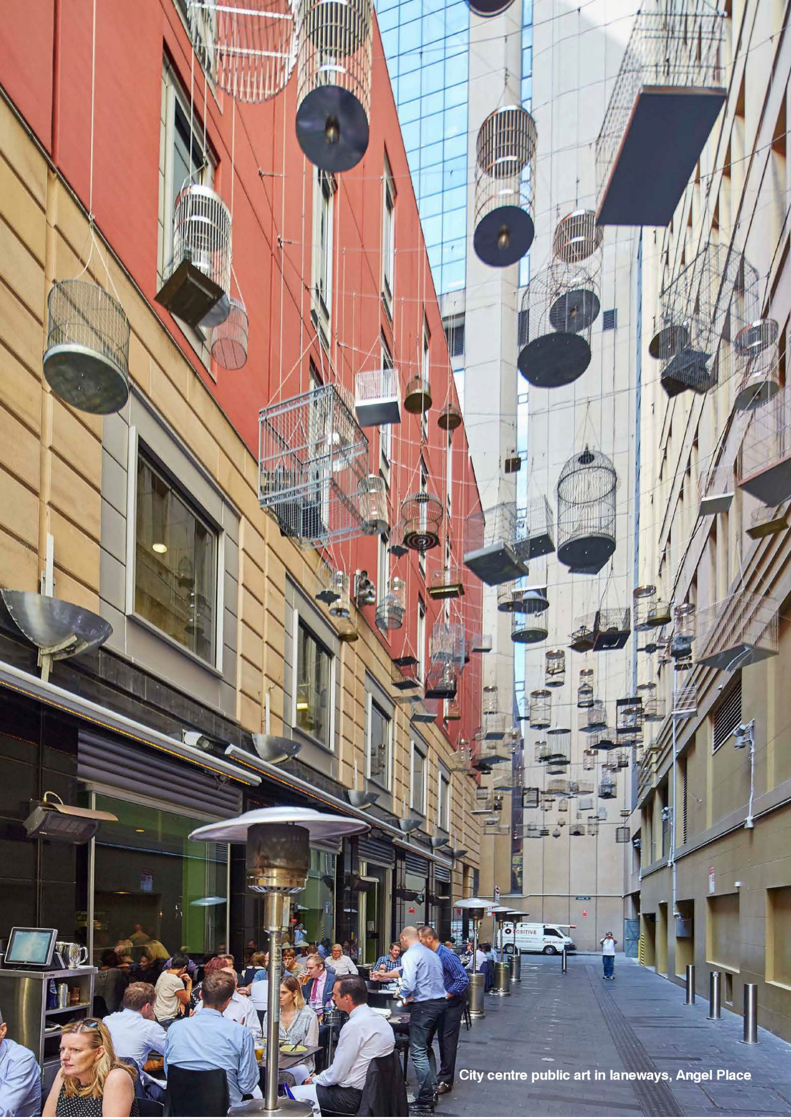
City centre public art in laneways, Angel Place