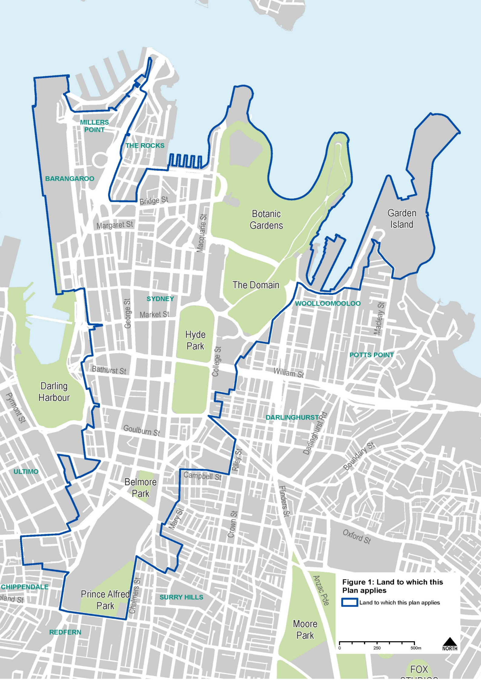
Figure 1: Land to which this Plan applies