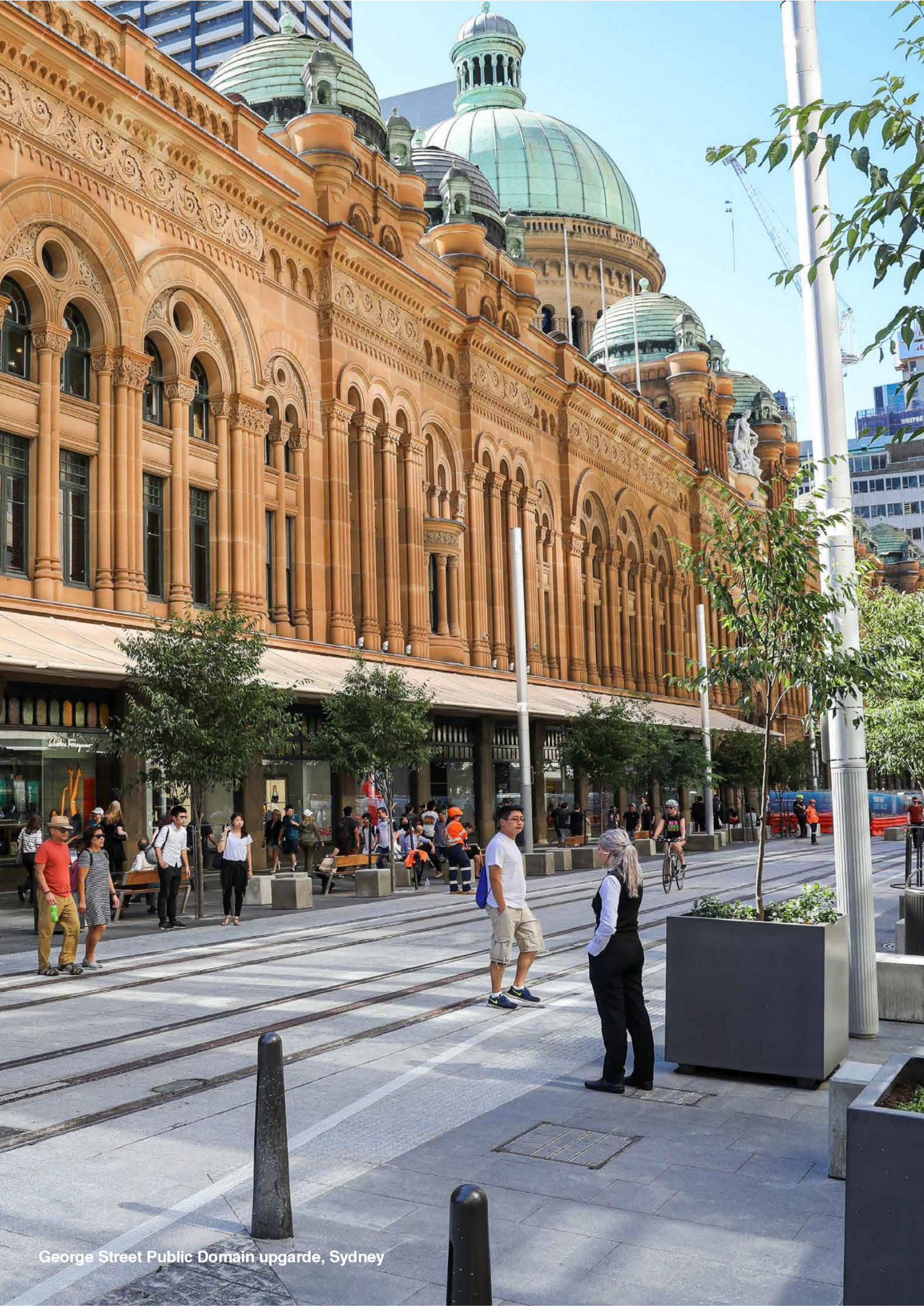
George Street Public Domain upgrade, Sydney