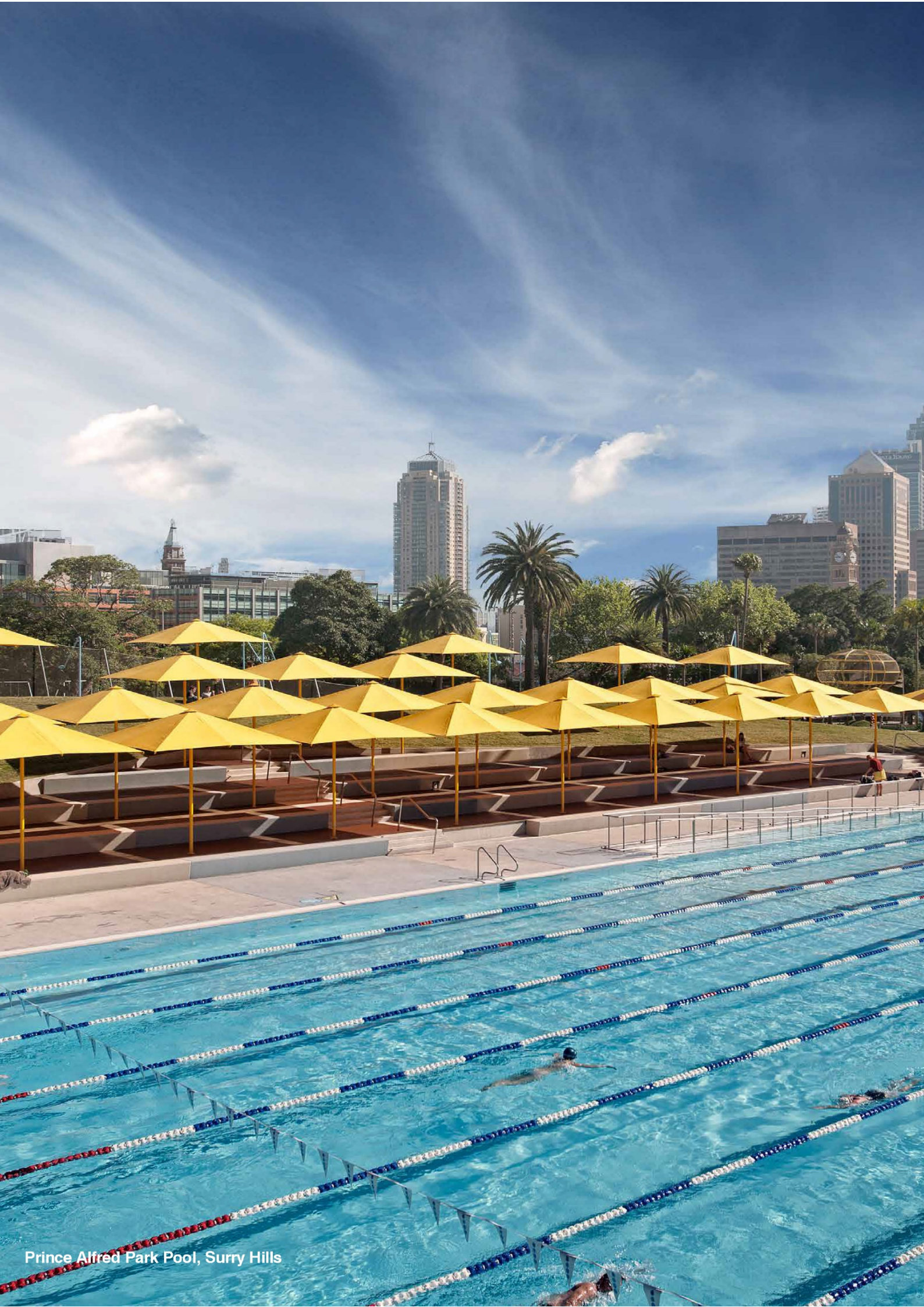
Prince Alfred Park Pool, Surry Hills