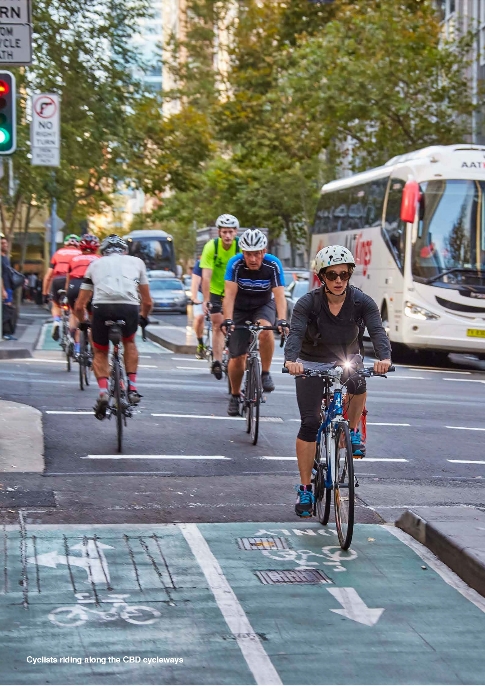
Cyclists riding along the CBD cycleways