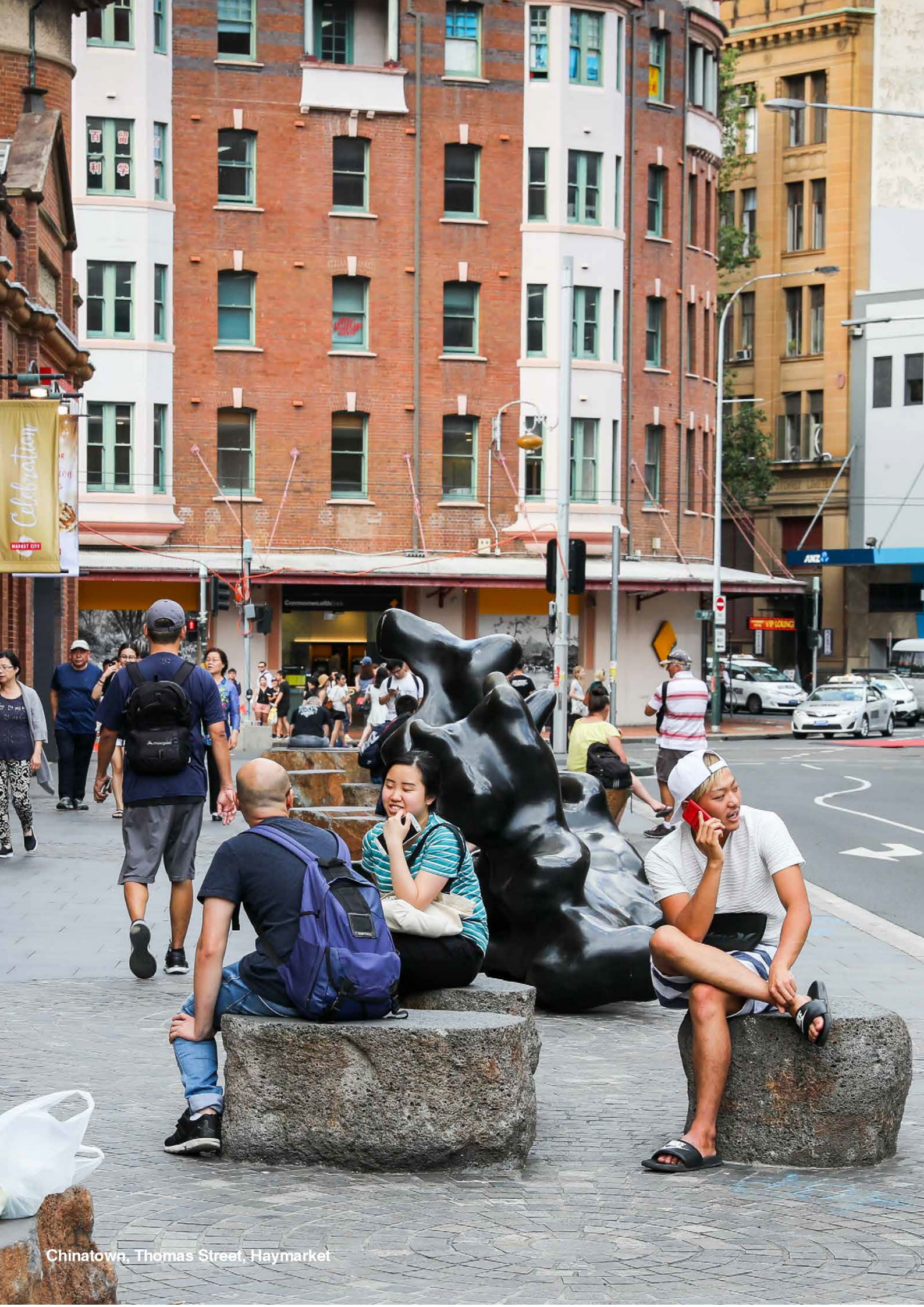
Chinatown, Thomas Street, Haymarket