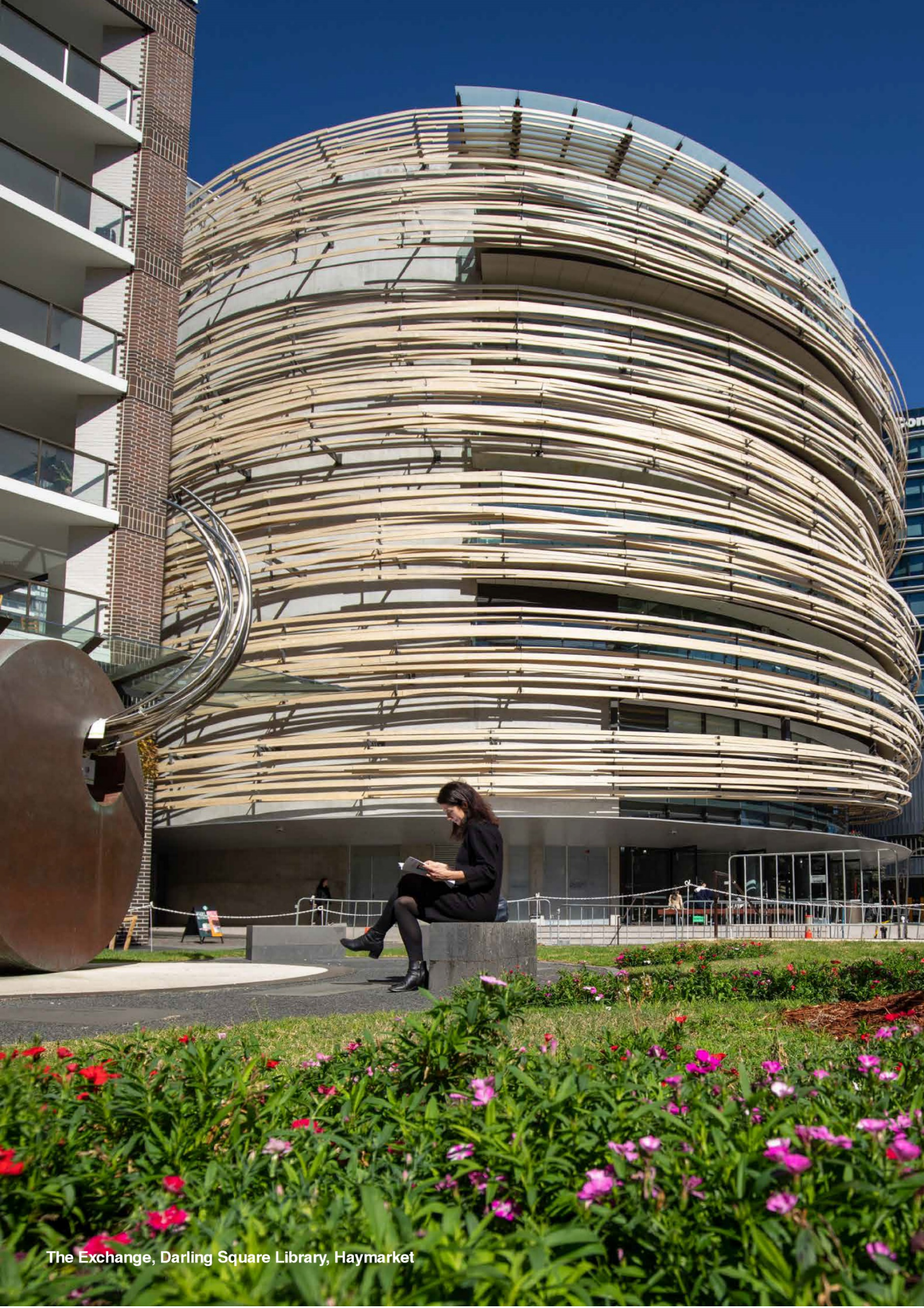
The Exchange, Darling Square Library, Haymarket